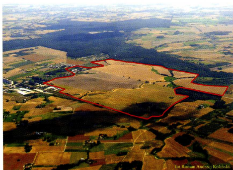
Investment site, Wąbrzeźno-Wałycz (190 ha)

Kujawsko-Pomorskie is among the very few Polish regions offering investment sites above 100 hectares. Available are infra-structurally developed land as well as industrial objects.